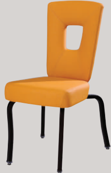
Kay Lang Collection