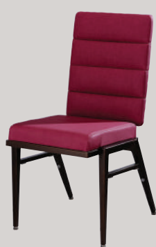
Kay Lang Collection