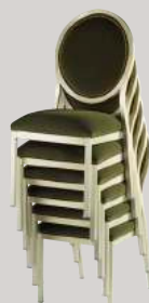
Seat-on-Seat Six High

Salons with standard seat nest six high or up to 10 high with optional pull-over seat as above.