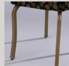
S: Steel base.

The MTS élan Nesting chair is perfect for those extended hours at the gaming tables. All élan nesting chairs are available with our optional "Extra-Wide" seat, a full 1 inch wider. Specify "W" after the base suffix (BE198-A-W, for example). Available on all élan models. And if you want even more, we offer our 198 élan series in "Mega-Size", 2½ full inches wider. Specify "M" after the base suffix.