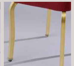
RA: Reeded aluminum base.