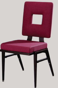
Kay Lang Collection