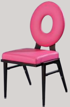
Kay Lang Collection