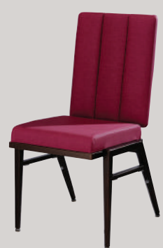
Kay Lang Collection