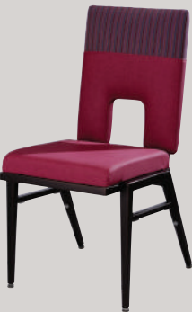
Kay Lang Collection