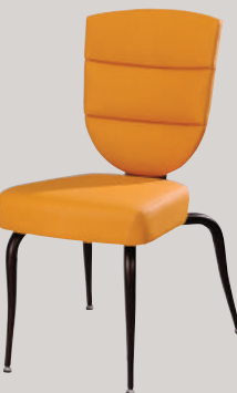
Kay Lang Collection

Also available in aluminum square leg, CF5501-A