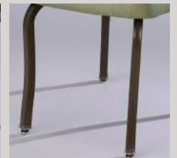
A: Smooth aluminum base.