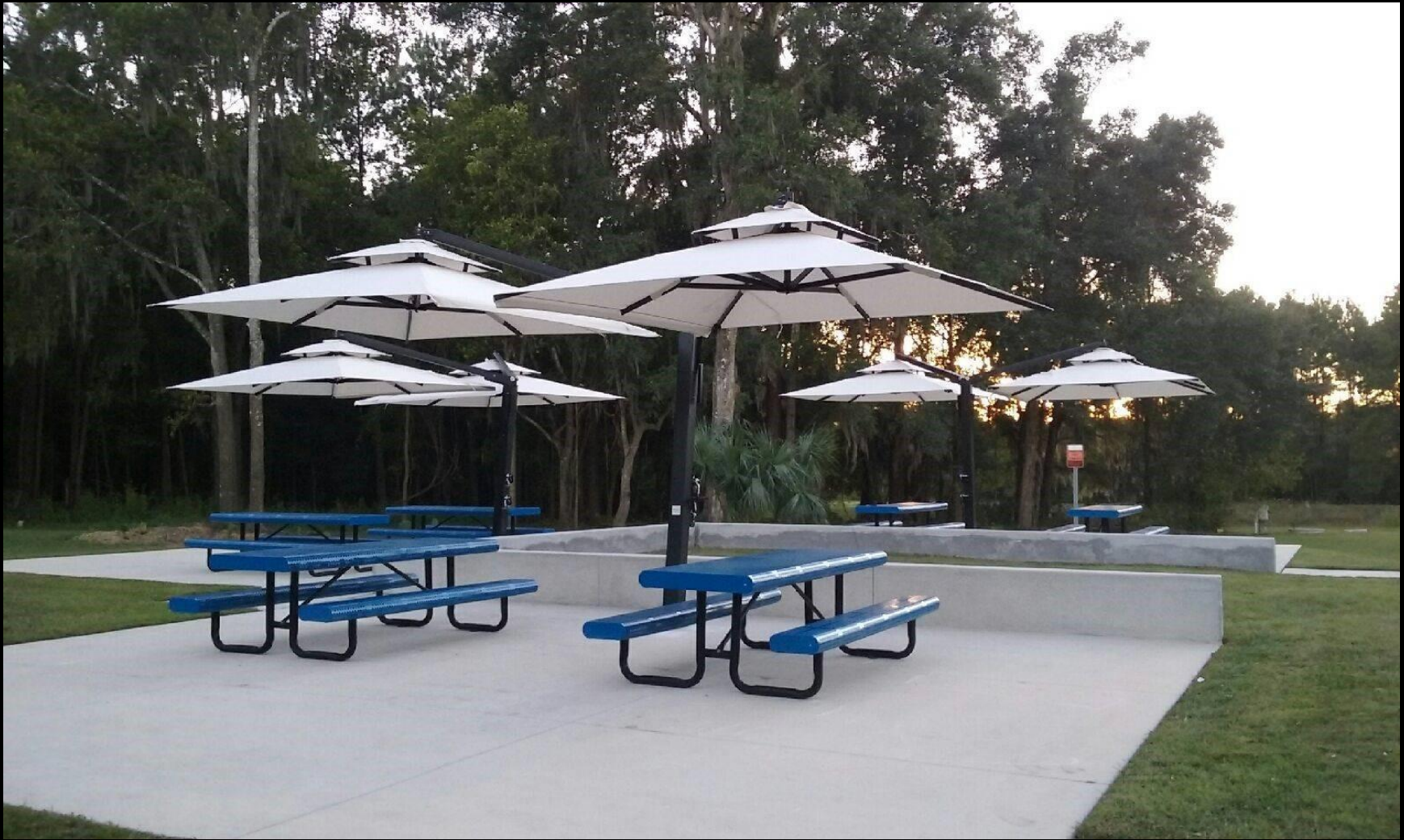
Taylor College Belleville Florida