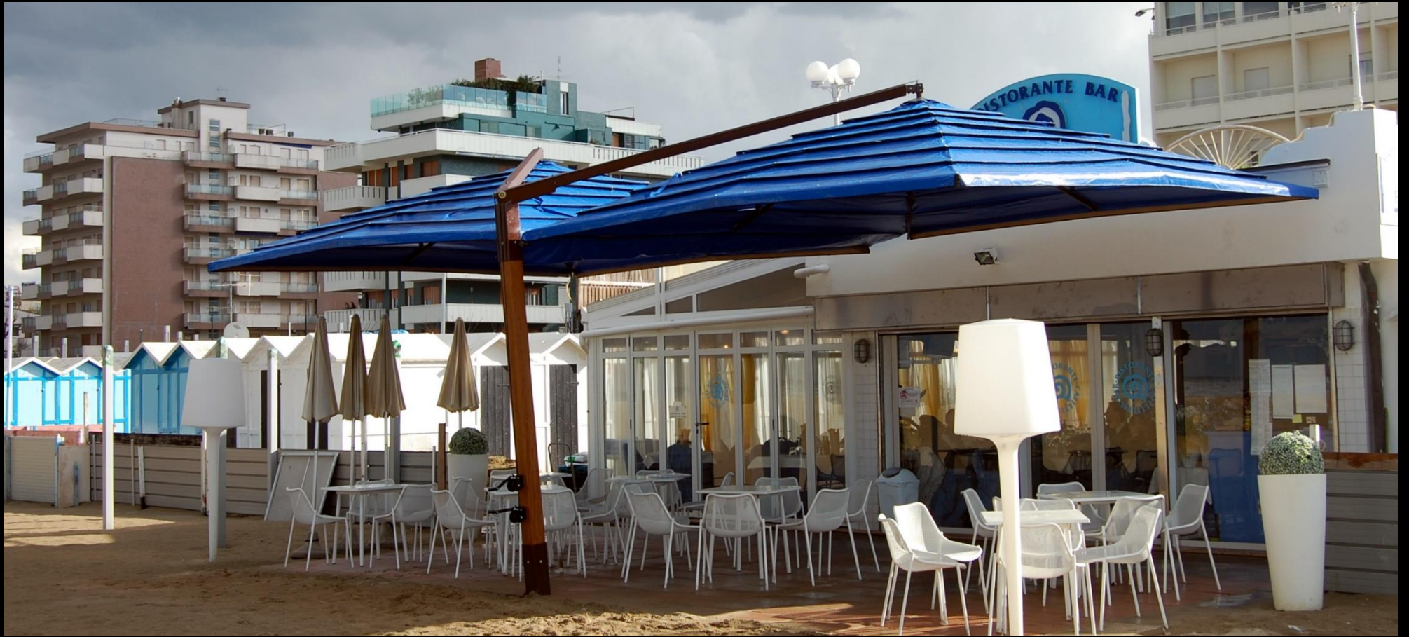
Freedom Double Umbrella